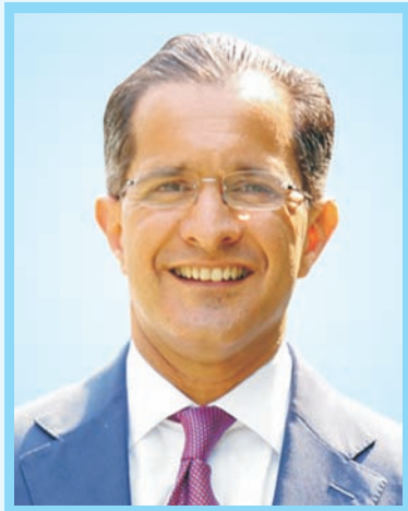
Mr. Vikram Oberoi Managing Director & C.E.O EIH Limited

Mr. Vikram Oberoi is the Managing Director and Chief Executive Officer of EIH Limited. He holds a Bachelor's degree in Science from Pepperdine University, California, USA and has over 25 years experience in the hospitality industry. He joined the Board as a Non-Executive Director on 15th December, 1993. He became a Whole-time-Time Director and was designated Deputy Managing Director in July 2004.