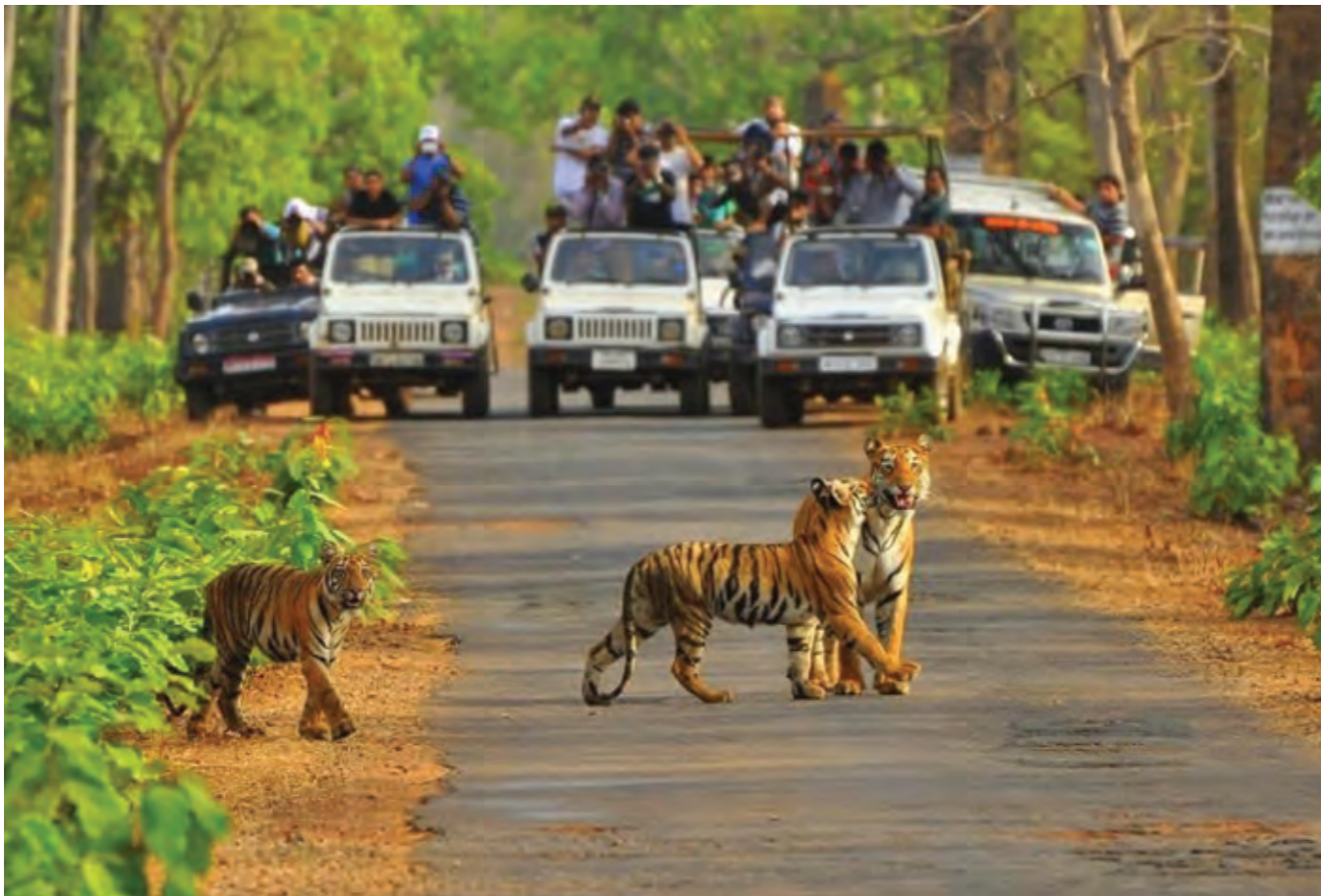
Sariska National Park