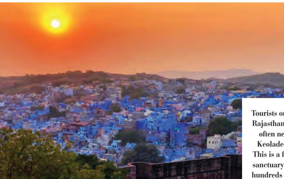
Blue City, Jodhpur