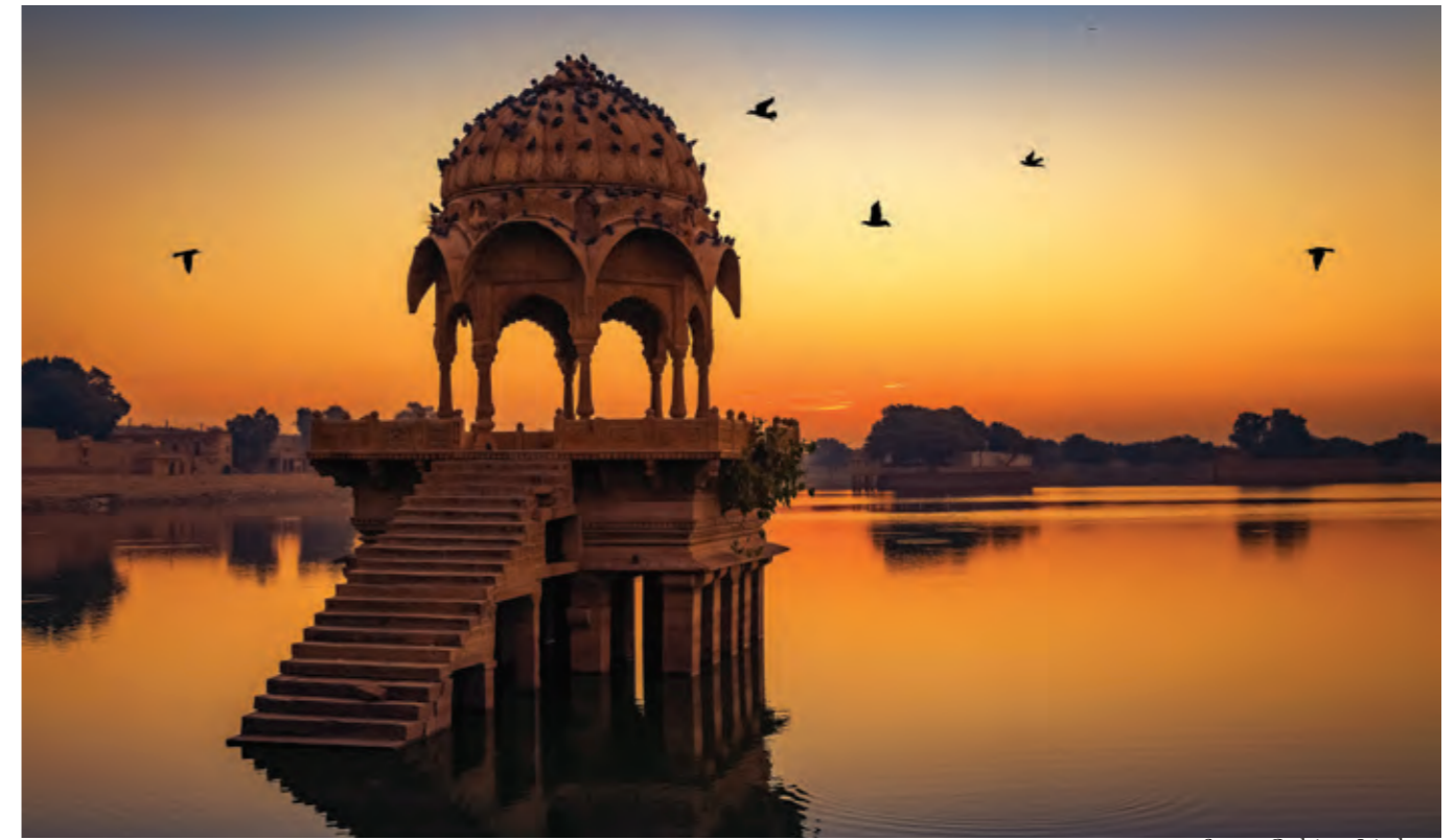
Sunset Gadsisar, Jaisalmer