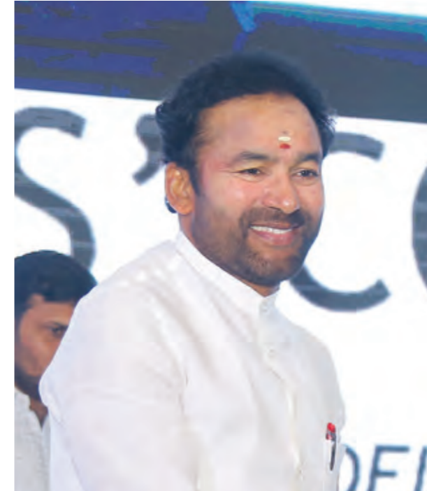
G KISHAN REDDY, Union Minister of Tourism, and Guest of Honour for the 5th HAI Hotelier’s Conclave