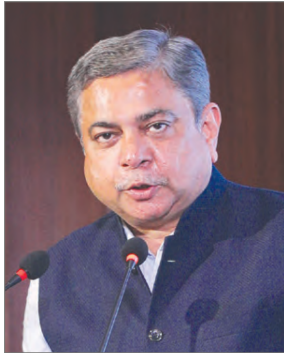
ARVIND SINGH, Secretary (Tourism), Government of India