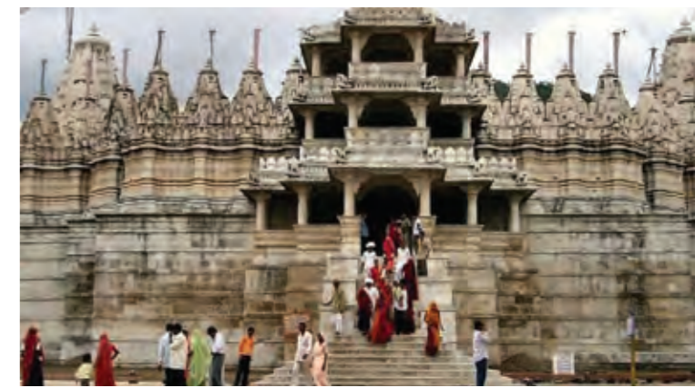
Dilwara Jain Temples, Mount Abu