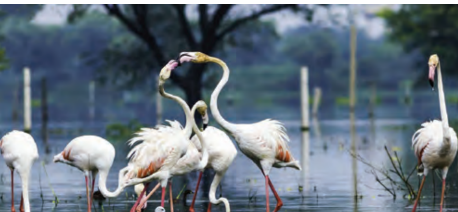
Bharatpur Bird Sanctuary