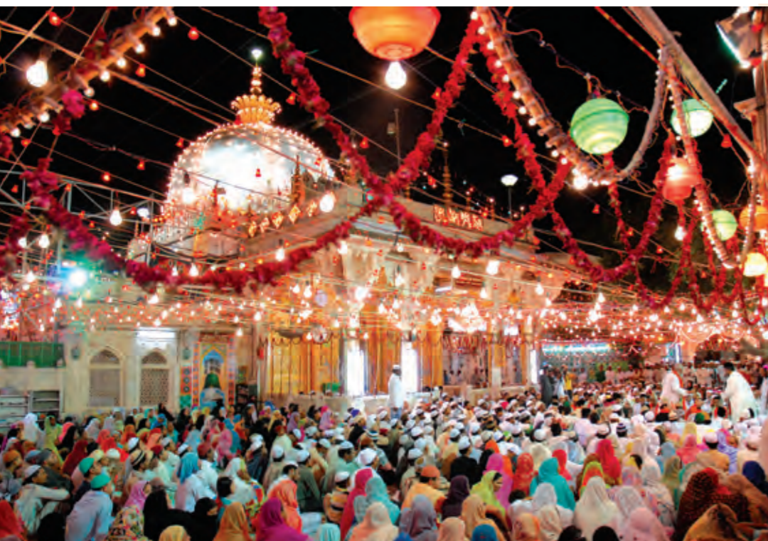
Ajmer Sharif Dargah

Rajasthan is a veritable hotbed of spiritual tourism in India. Pilgrims from across the globe flock to the state to visit its many sites of religious significance. The famous Ajmer Sharif Dargah is a multi-faith space, which sees millions of visitors annually. Pushkar's historic Brahma temple is absolutely unmissable, as are the multiple festivals attached to it. In downtown Udaipur, overlooking Lake Pichola, the famous Karni Mata temple is an architectural masterpiece. Other places, which are definitely worth a visit are Nathdwara temple, outside Udaipur, the Eklingji temple and the Birla Mandir in Jaipur. HAI