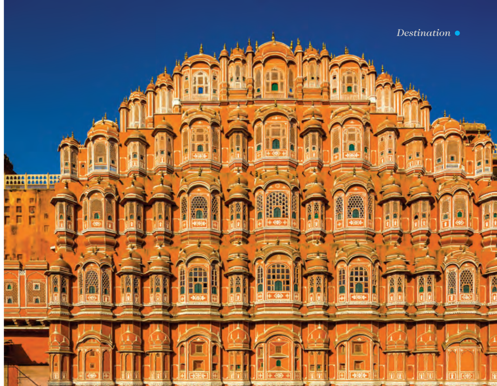
Hawa Mahal, Jaipur