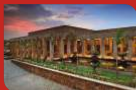
The Lalit Mangar