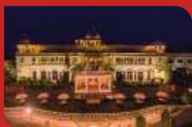
The Lalit Laxmi Vilas Palace Udaipur