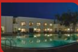
The Lalit Temple View Khajuraho