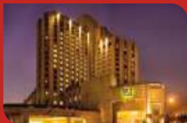
The Lalit New Delhi