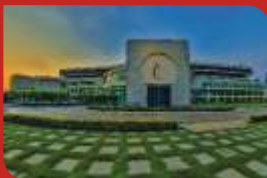
The Lalit Chandigarh