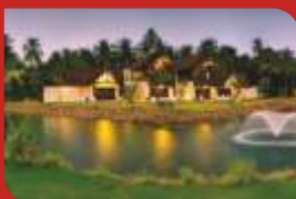
The Lalit Resort & Spa Bekal (Kerala)