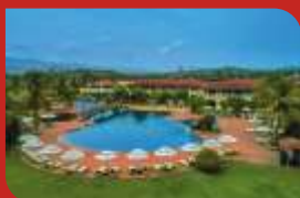
The Lalit Golf & Spa Resort Goa