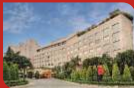
The Lalit Ashok Bangalore