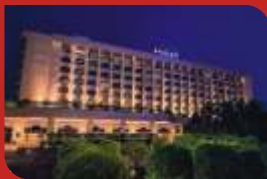
The Lalit Mumbai