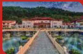
The Lalit Grand Palace Srinagar