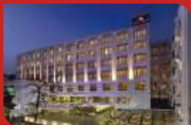
The Lalit Great Eastern Kolkata