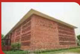
The Lalit Suri Hospitality School Faridabad