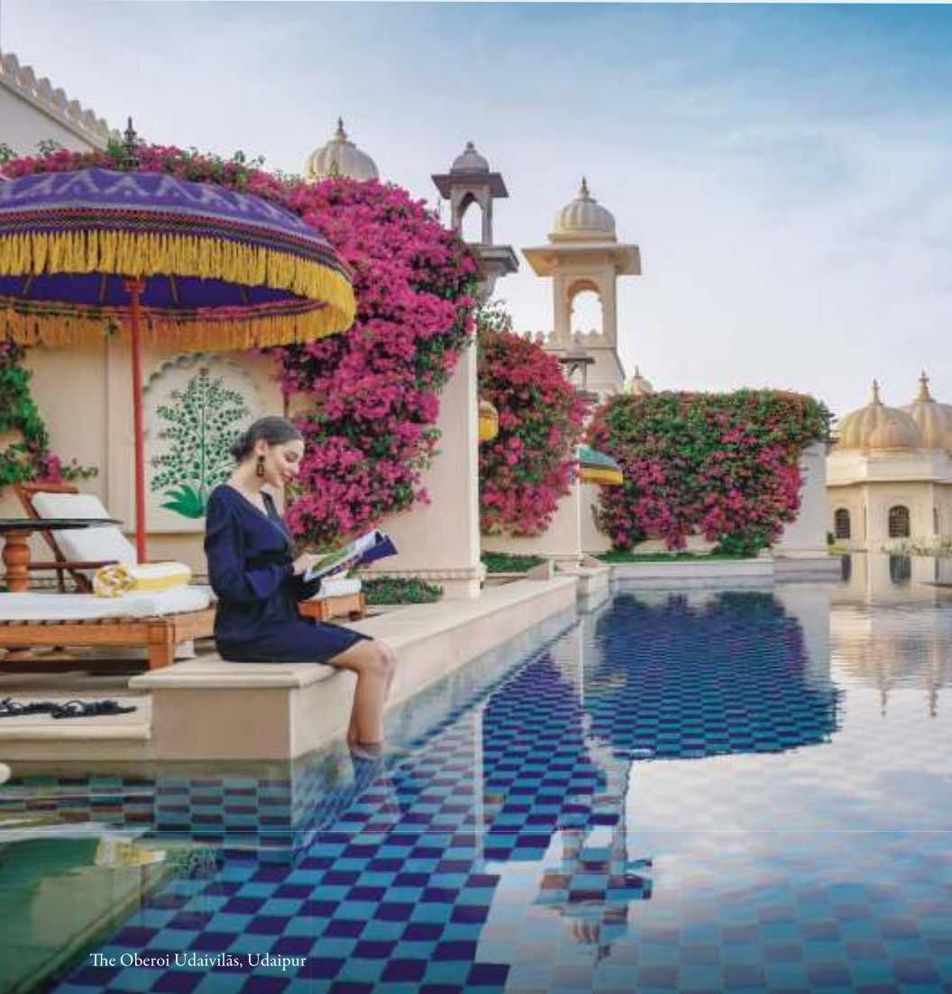
The Oberoi Udaivilās, Udaipur

Wherever you find us, you will find the heart of Oberoi. Discover some of the world's most fascinating destinations, experience our unrivalled locations and architecture that captures the essence of the locale. All complemented by the sincere, caring service, that is famously Oberoi. Heart. Felt.