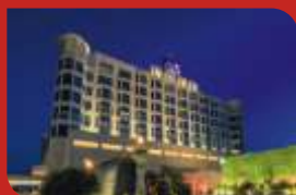
The Lalit Jaipur