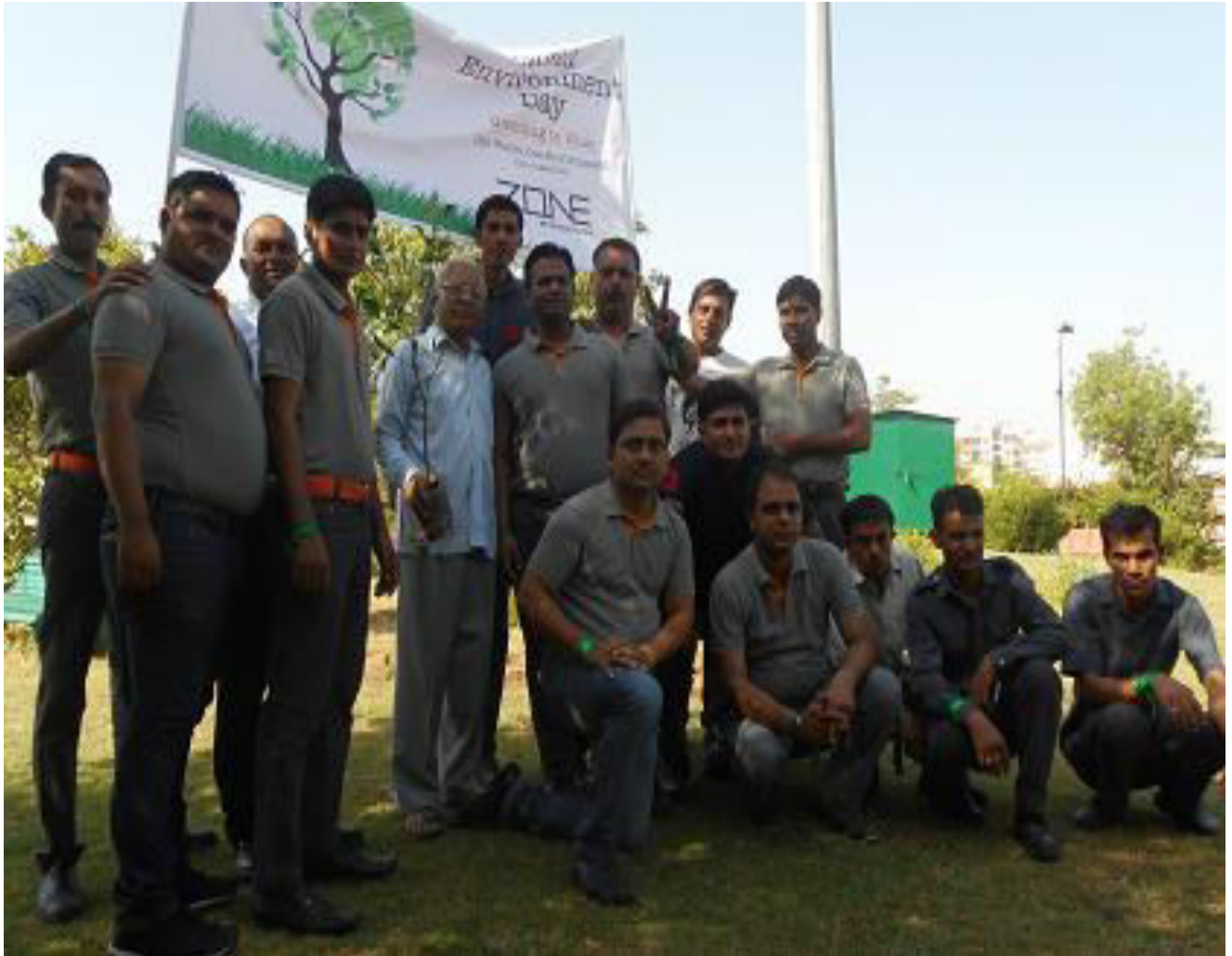
Followed by outdoor activity we organized Indoor drawing competitions for Zoners on world environment day theme.