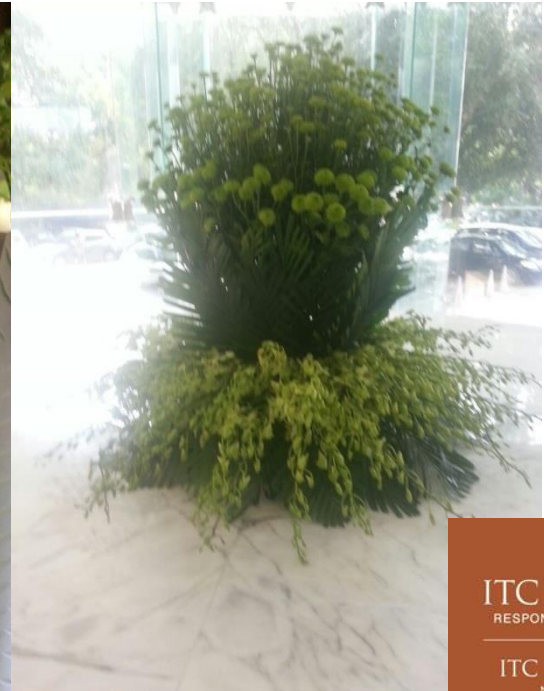
Green Theme in Hotel Public Areas