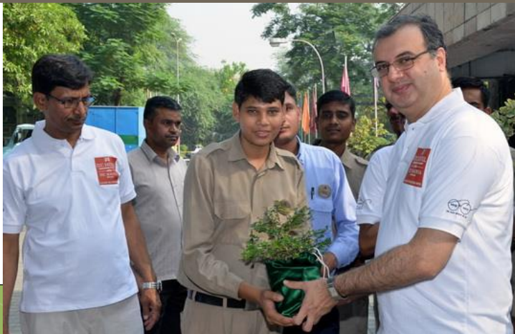
Sapling Distribution to associates