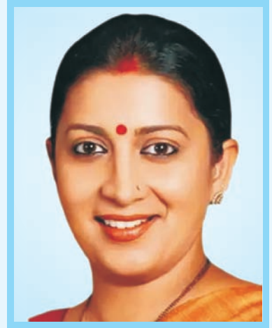
Smt. Smriti Irani Hon'ble Minister of Women and Child Development, Govt. of India

Smt. Smriti Zubin Irani has been Minister of Women and Child Development since 2019, and also Minister of Minority Affairs since 2022. She previously served as Minister of Human Resource Development (2014 to 2016), Minister of Textiles (2016 to 2021), and Minister of Information and Broadcasting (2017 to 2018). She was the youngest minister (at age 43) in Prime Minister Narendra Modi's second ministry in 2019.